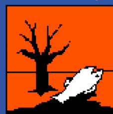
Dangerous for the environment